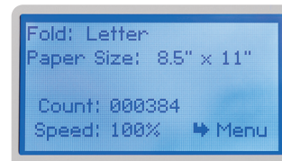
Large LCD Interface provides ease of use