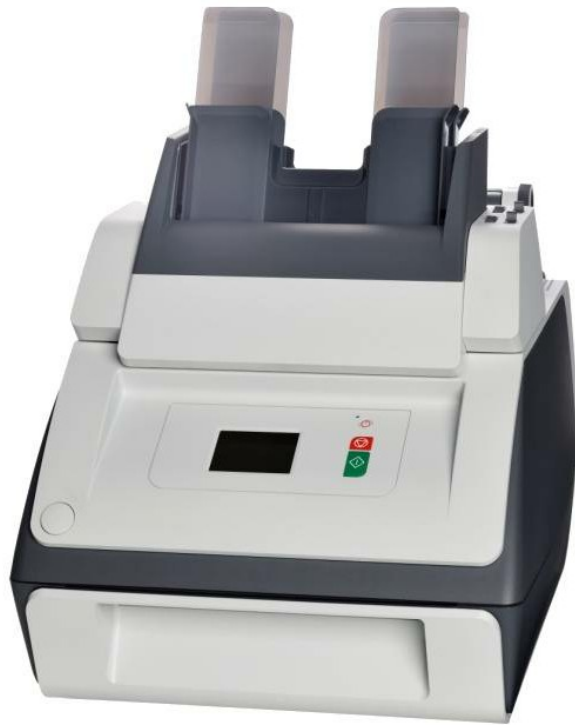
FPI 600 Tabletop inserting system

Fold, insert and seal – 10x faster than by hand.