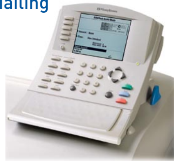
IntelliLink® Control Centre