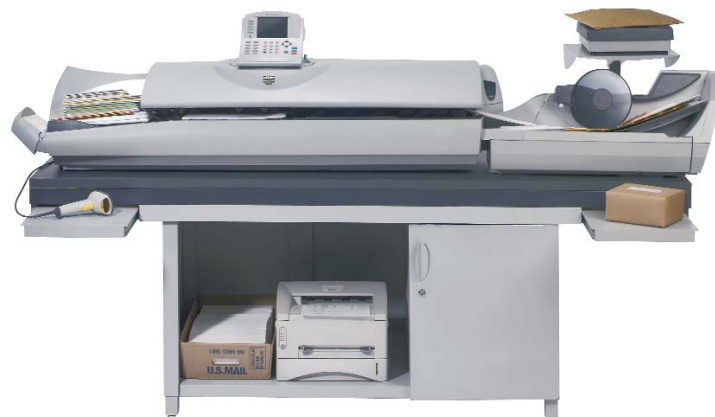
System pictured above shows the optional Console and Power Stacker. These features help to maximize productivity.

If you need service, our nationwide network of 1500 trained Pitney Bowes service professionals is ready to help. Our Computer Enhanced Service Management System lets us record your request, instantly call up a complete history of the equipment, and quickly dispatch a local Customer Service Representative with the right skills.